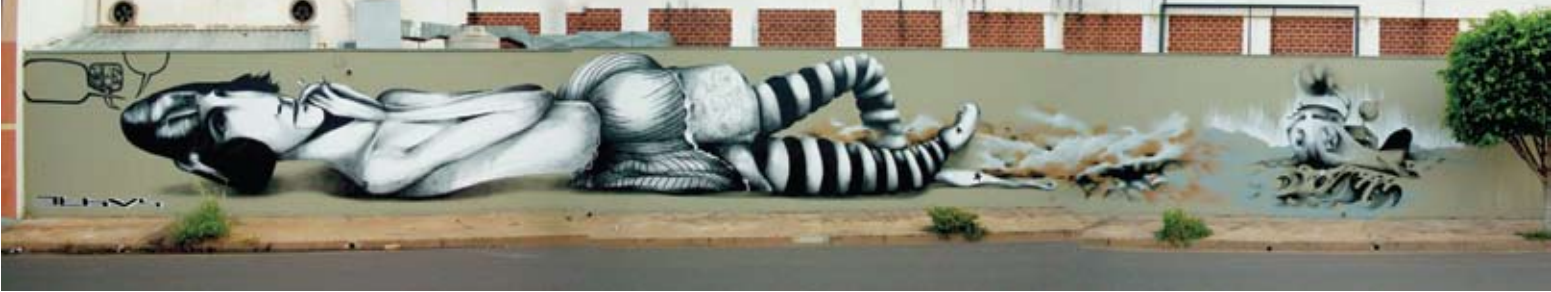
01 & 02: Sao Paulo / Brazil, 2008