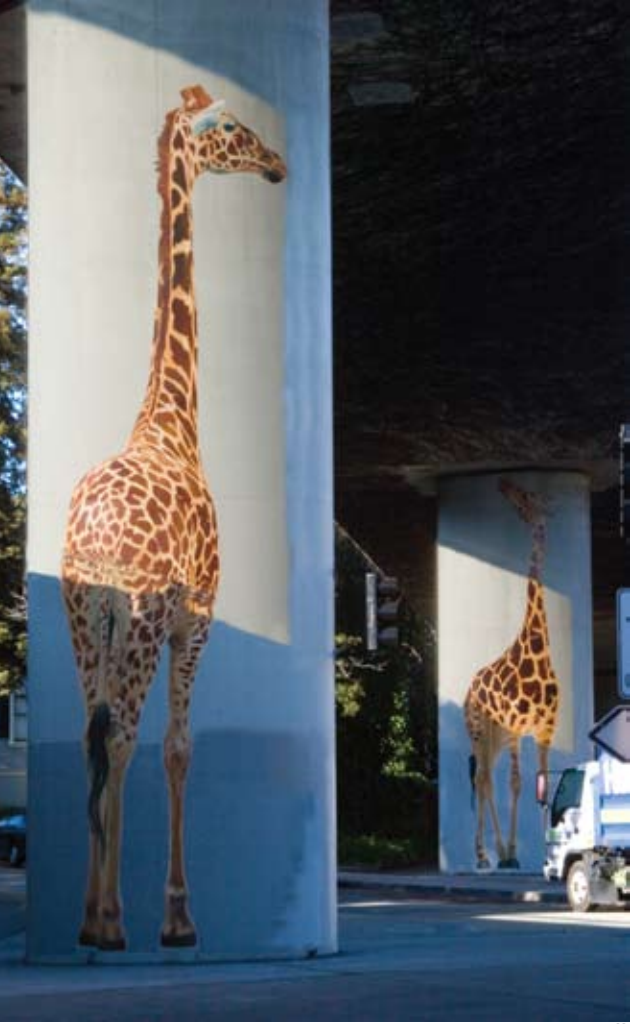
01: «The Lake Merritt Mural Project». Oakland, California / USA, 1987 02: «Animurals». Oakland, California / USA, 1985 03: «Giraphics». Oakland, California / USA, 1984 & 1994.