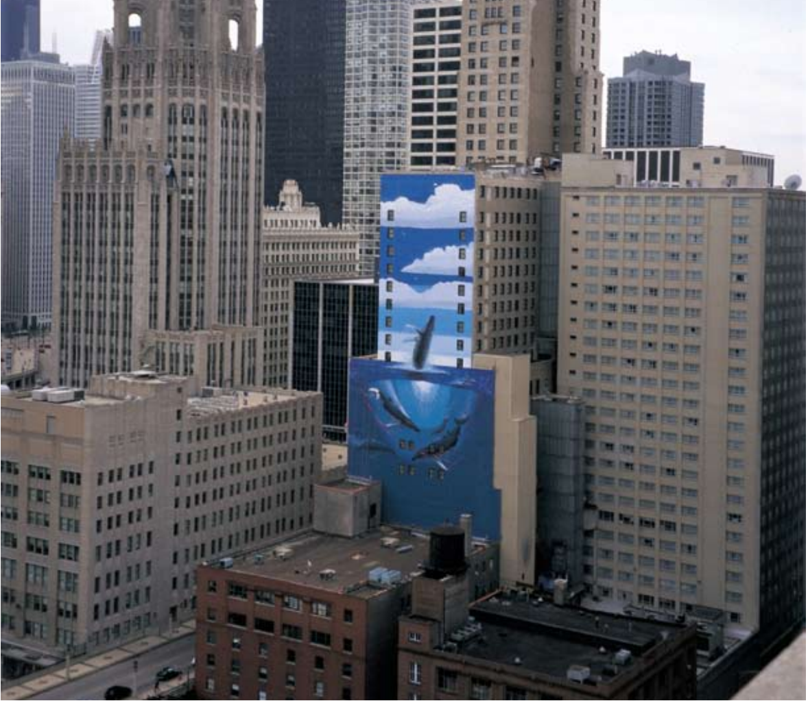
01: «The Windy Whales». Whaling Wall 73. Chicago, Illinois / USA, 1997 02: «Whale Tower». Whaling Wall 76. Detroit, Michigan / USA, 1997