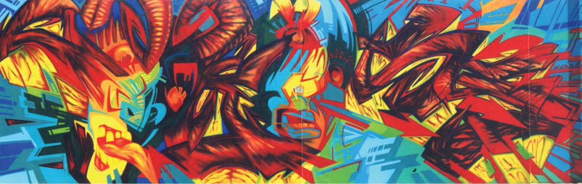
01: «Red devils 10 years anniversary». Savigny / France, 1998 02: «Lokiss - Lokiss (+skki)». Paris / France, 1988