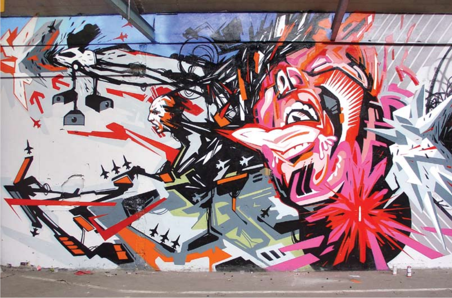
01: «My security against me». Lyon / France, 2006

Lives & Works in France Human birth 1968 – Graffiti Birth 1985 SUPER TOY. Anti ultracommercial hiphop / pop graffiti activist. Anti US omnipotency over graffiti subculture militant. Founder of the «GRAVEFFITI» movement: postneomodern ultramedia perversion of the graffiti doctrine. Still and always ready for solo battle against self-proclaimed Kings. BUT AN EXPERIMENTAL TOY.