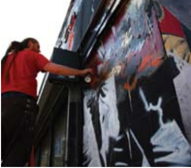
Born in Cork, Ireland 1980. Education – BA Painting, Limerick School Of Art And Design, 1998 – 2002. Lives / works in London since 2004.