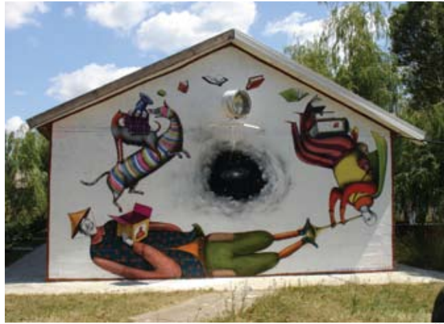
01: AEC & WAONE. Moscow / Russia, 2008 02: AEC & WAONE. Kiev / Ukraine, 2006 03: AEC, WAONE & KISLOW (EAAbi crew). Mariupol / Ukraine, 2007