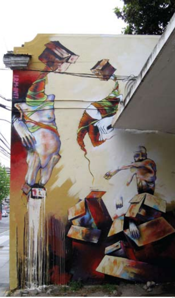
01: Together with Lag1. Almagro / Spain, 2008 02: Together with Hes and Dees. Valparaíso / Chile, 2007 03: Together with Lrm. Valparaíso / Chile, 2008