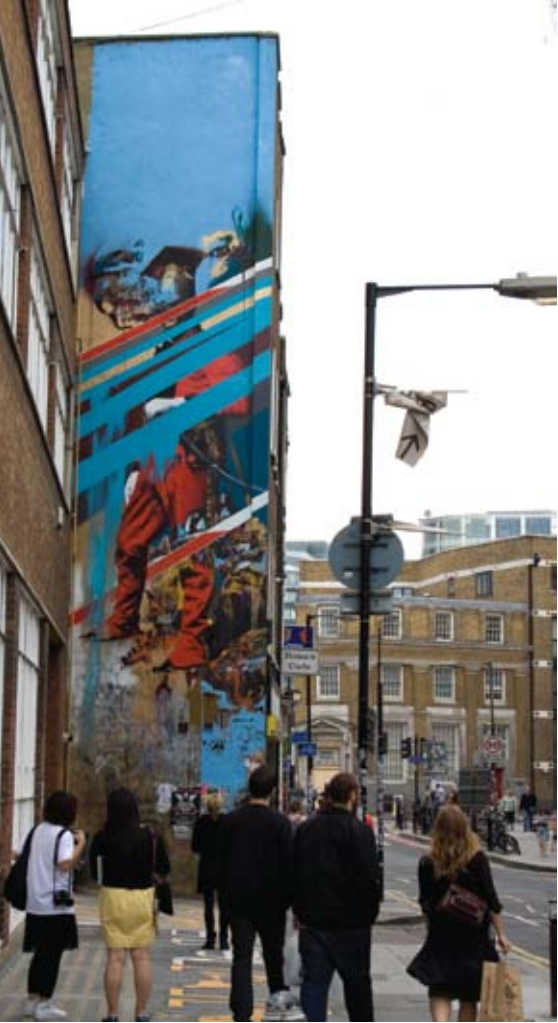
01: London / UK, 2008 02: «Dinnertime Bandit». London / UK, 2008