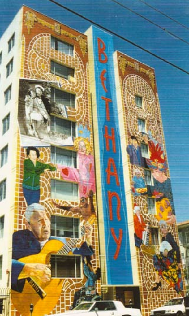
01: «Salud, the Bethany Senior Center Mural». San Francisco, California / USA, 1997 02: «The Luther Burbank Mural». Oakland, California / USA, 2003.