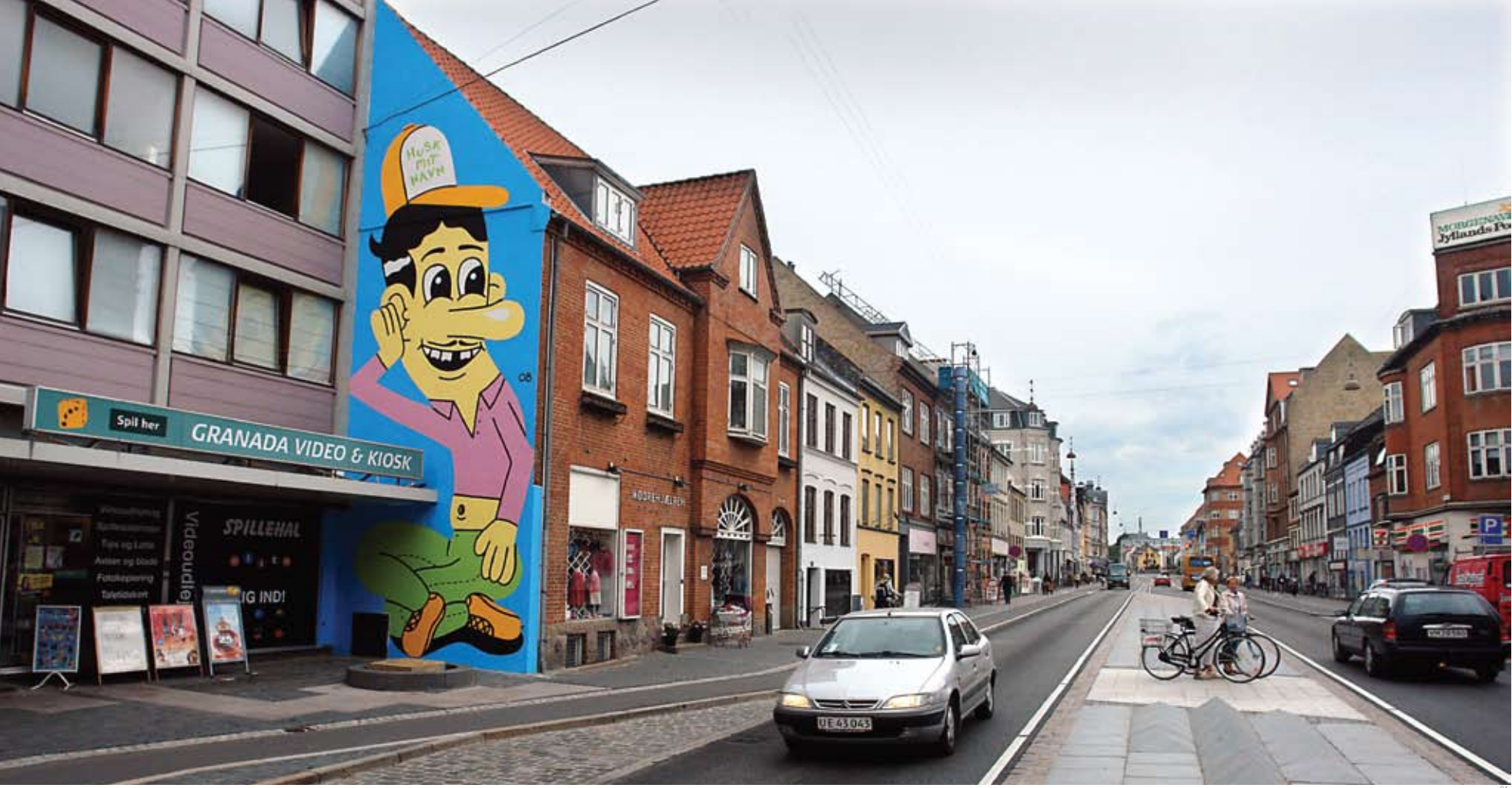
01: Artist: HuskMitNavn. Aarhus / Denmark, 2008.