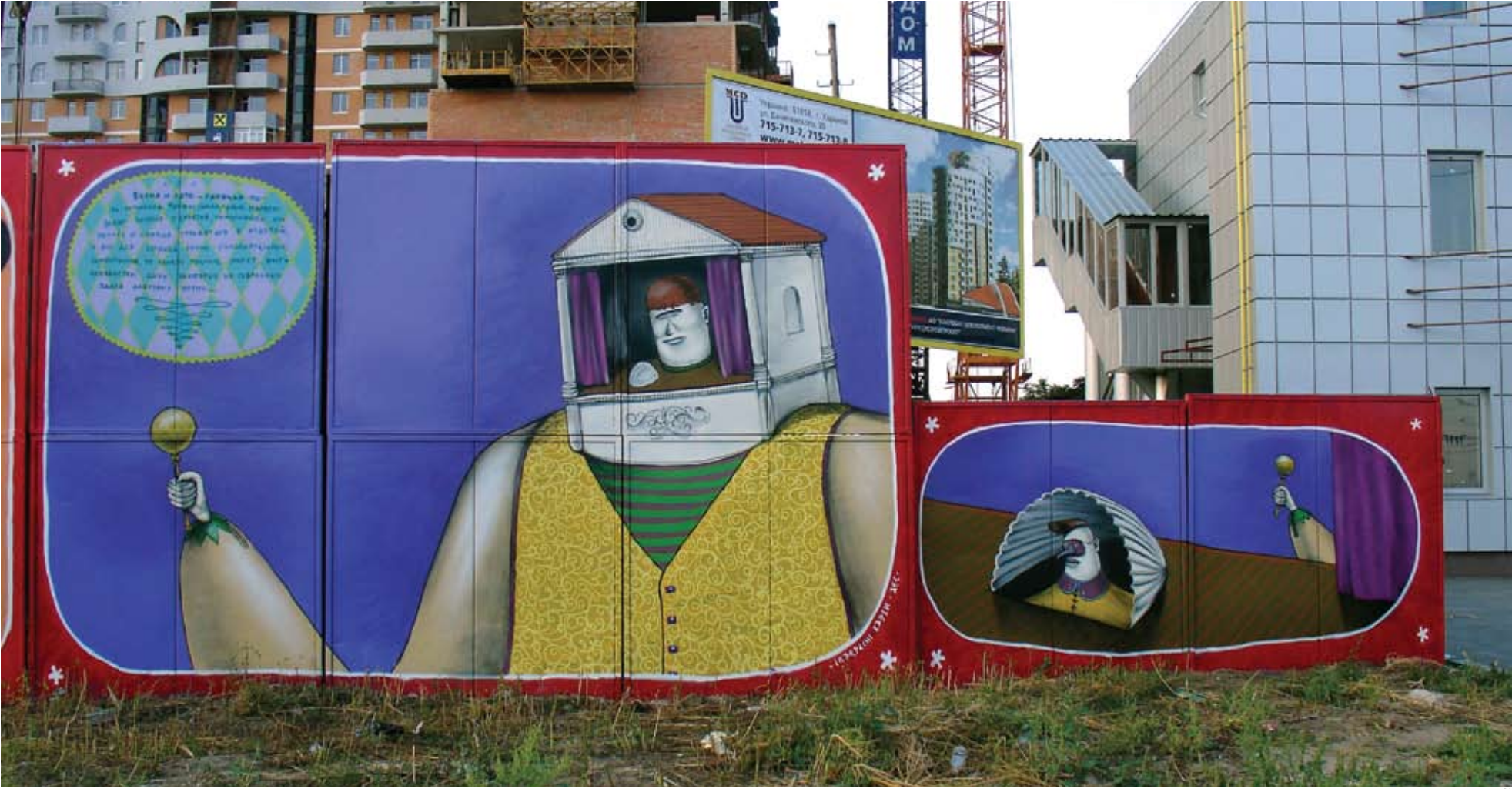
01: AEC. Kharkov / Ukraine, 2006