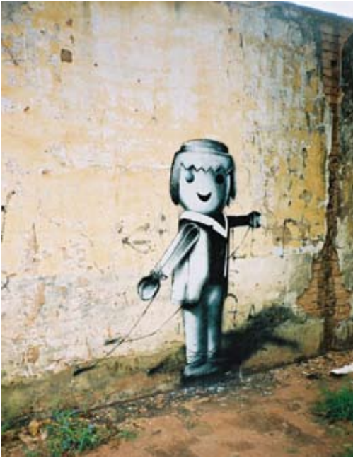
01 - 04: Sao Paulo / Brazil, 2008