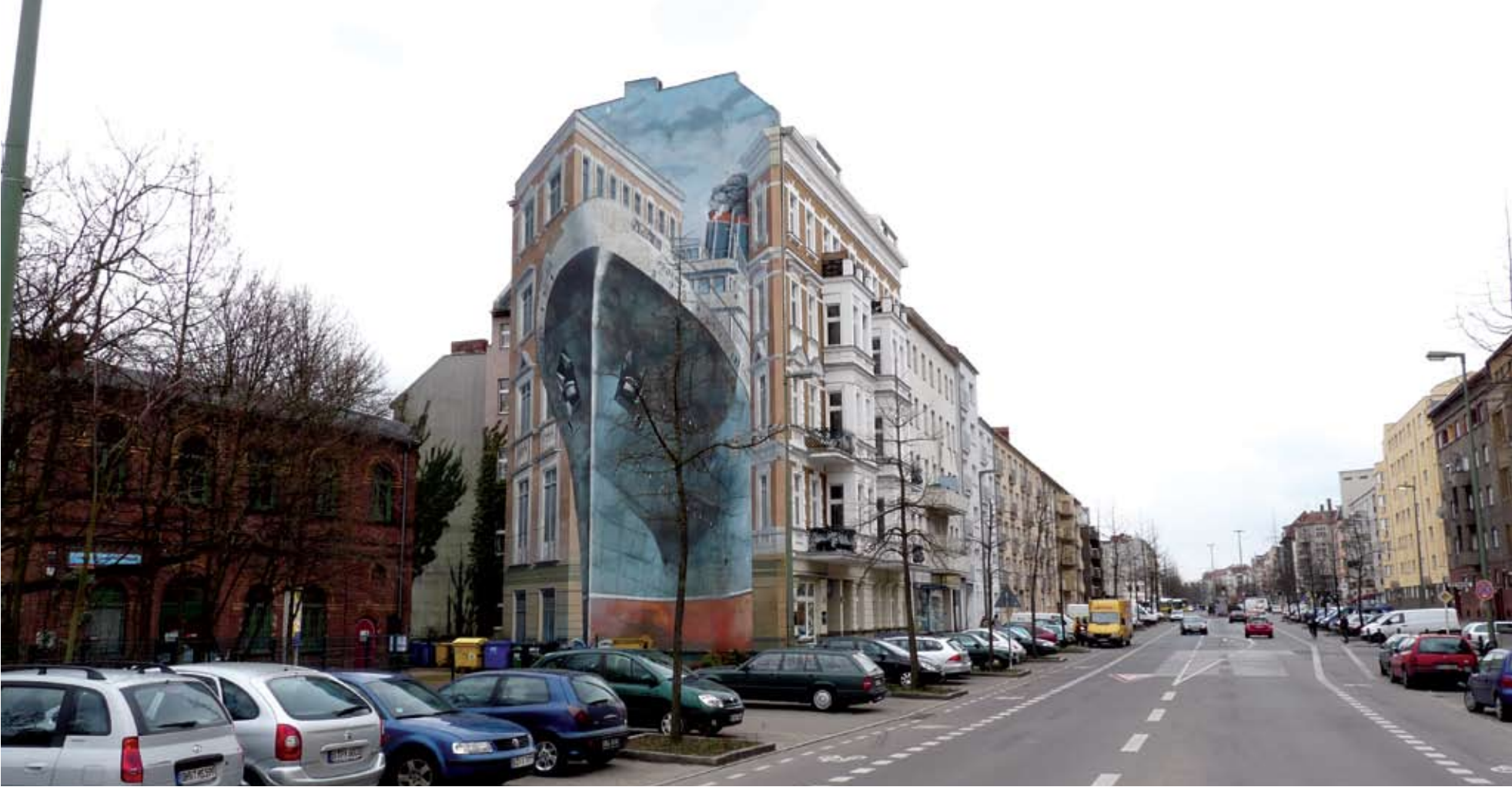
01: «Phoenix». Together with Dirk Herzog. Berlin / Germany, 1989.