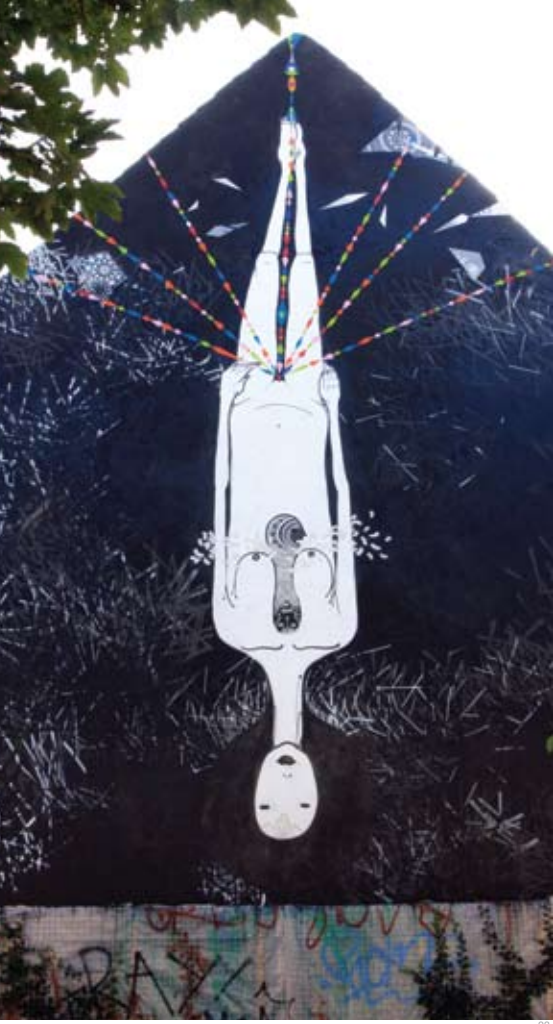
01: Artist: Faust. Aarhus / Denmark, 2008. Photo © Miriam Nielsen 02: «Falling Graffiti». Artist: Ash. Aarhus / Denmark, 2008. Photo © Miriam Nielsen 03: «Golden Shower». Artist: Herbert Baglione. Aarhus / Denmark, 2008. Photo © Miriam Nielsen