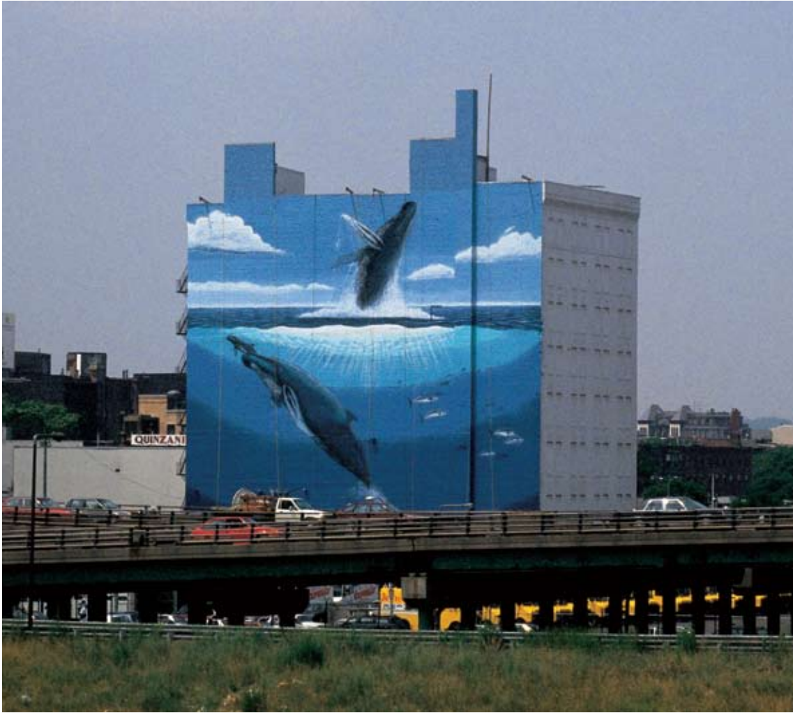
01: «Stellwagen Bank». Whaling Wall 38. Boston, Massachusetts / USA, 1993

(Photo portrait: «Sea of Life». Whaling Wall 97. Plymouth / UK, 2008.)