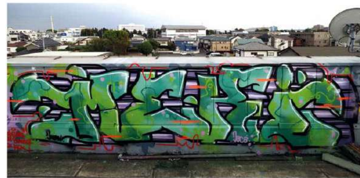
Kiel | Eckernförde | Aurich | Tokio | MEKI, ZZTOP: Hamburg