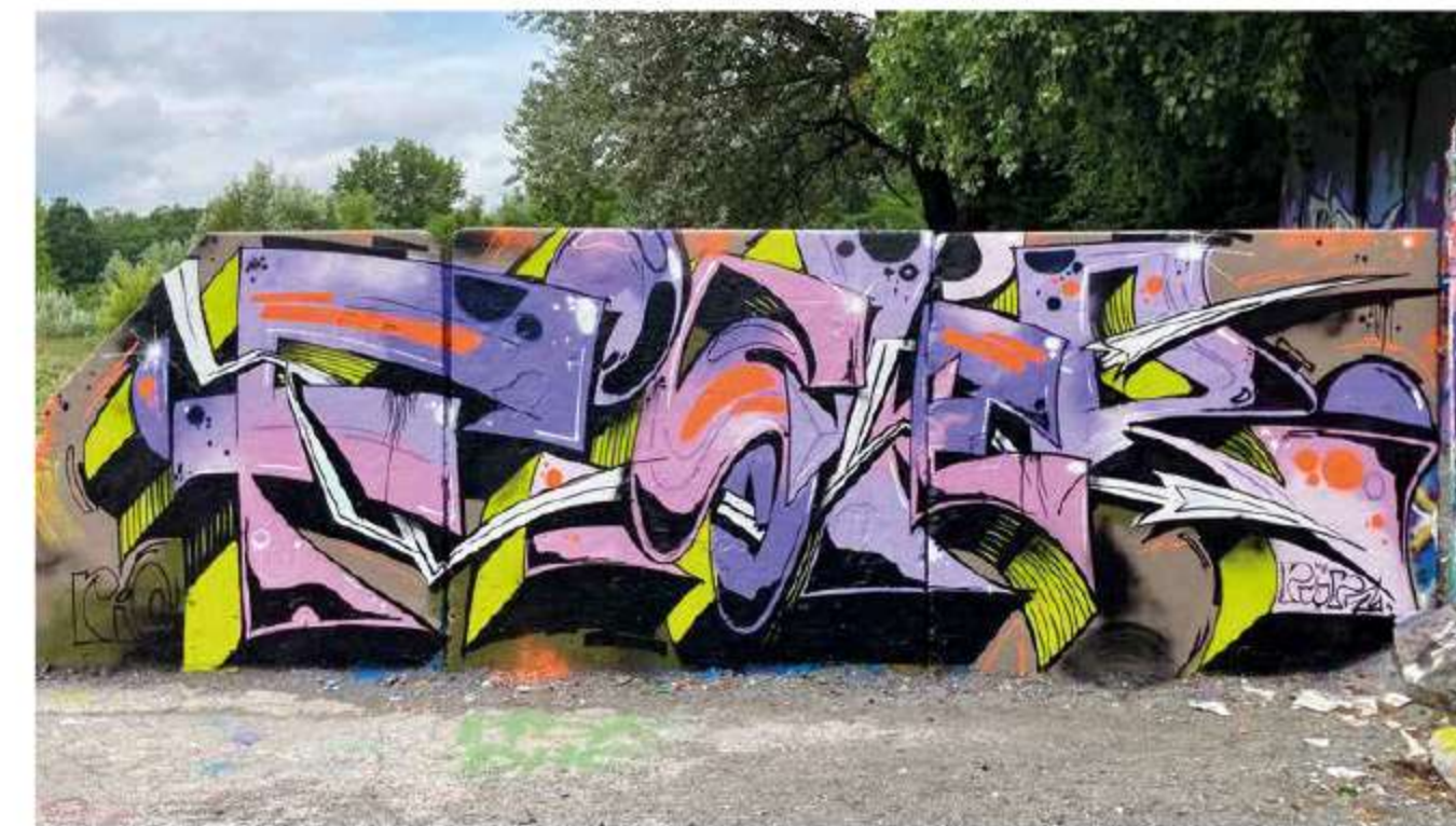
MSIR, MOST: Berlin | FISTER: Berlin JAZZ: Berlin | MYNT, BIRNE: Hamburg