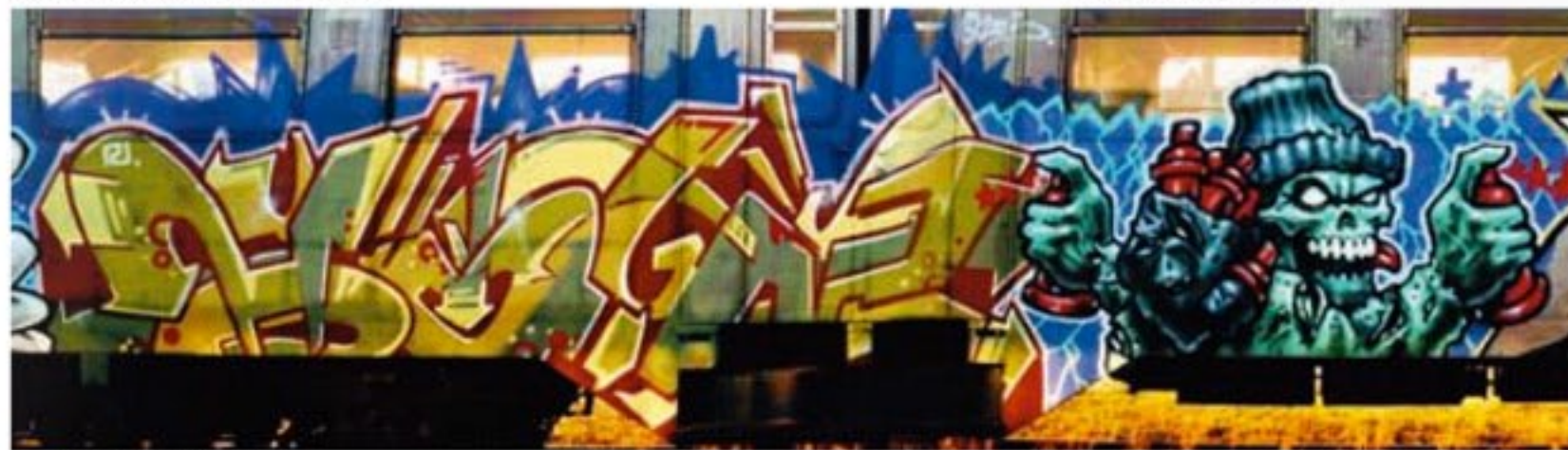
HOW, WON / Munich, Germany / 2003

WON ABC TSR: I don't see those two freaks often, but when I do, then it's always as if we had just met yesterday—a great friendship. Their creative ability to transform things is also amazing. That is what I love about them—the way they constantly cover new artistic territory and never