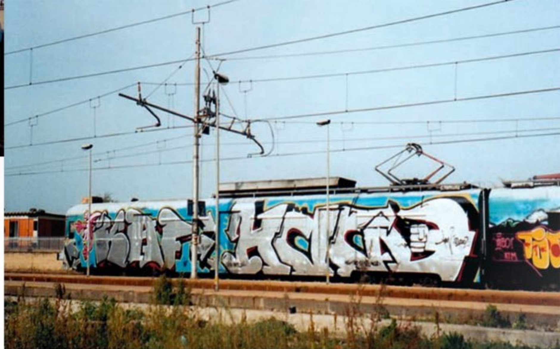
HOW / Napoli, Italy / 2002

stagnate. They always uphold their quality standard and amaze people with new ideas. Those two are a double pack color bomb with cluster munition... Collateral damage guaranteed. I would also like to have a clone at my side. But I have to settle for my two hands and one brain, respect.