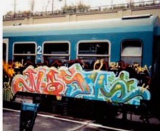
NOSM / Budapest, Hungary / 2002