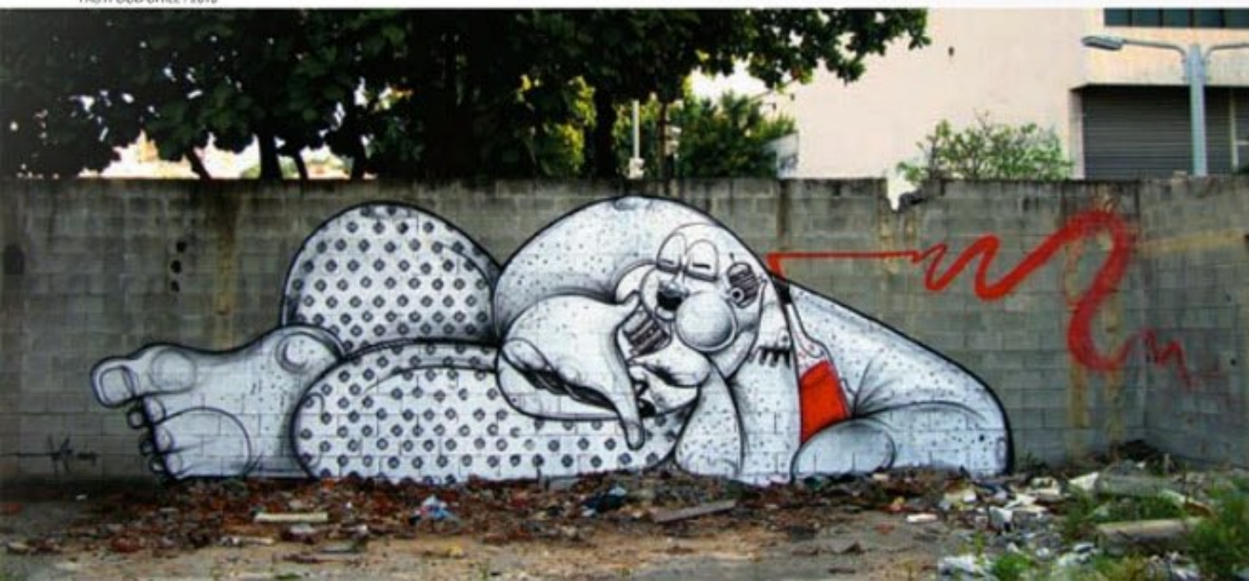
FASTFOOD CHILL / 2010