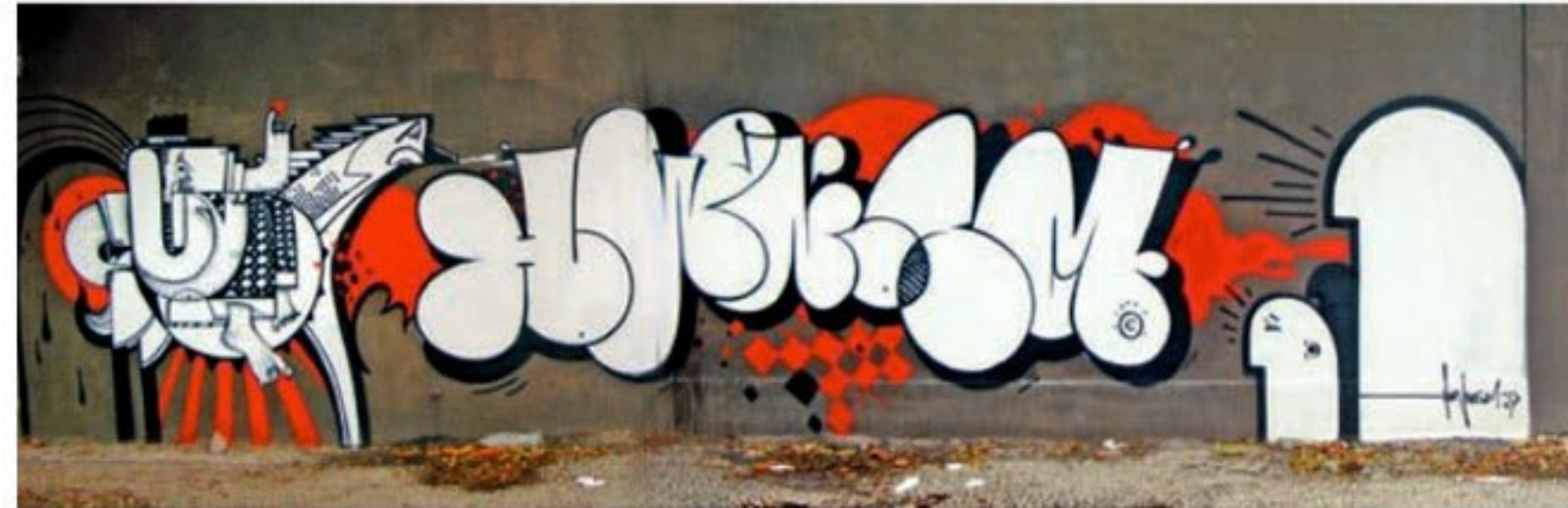
'JOCKEY CLUB' / 2009

impression. We're always venturing into different genres of the graff movement and style world, and now the art world; but since we are vandals at heart there is still a need for destruction and vandalism. GRAFF, all or nothing, is the motto—that is who we are. We can't and won't neglect this fact, no matter what circles we move in. It is necessary for the movement so it doesn't die out. HOW&NOSM