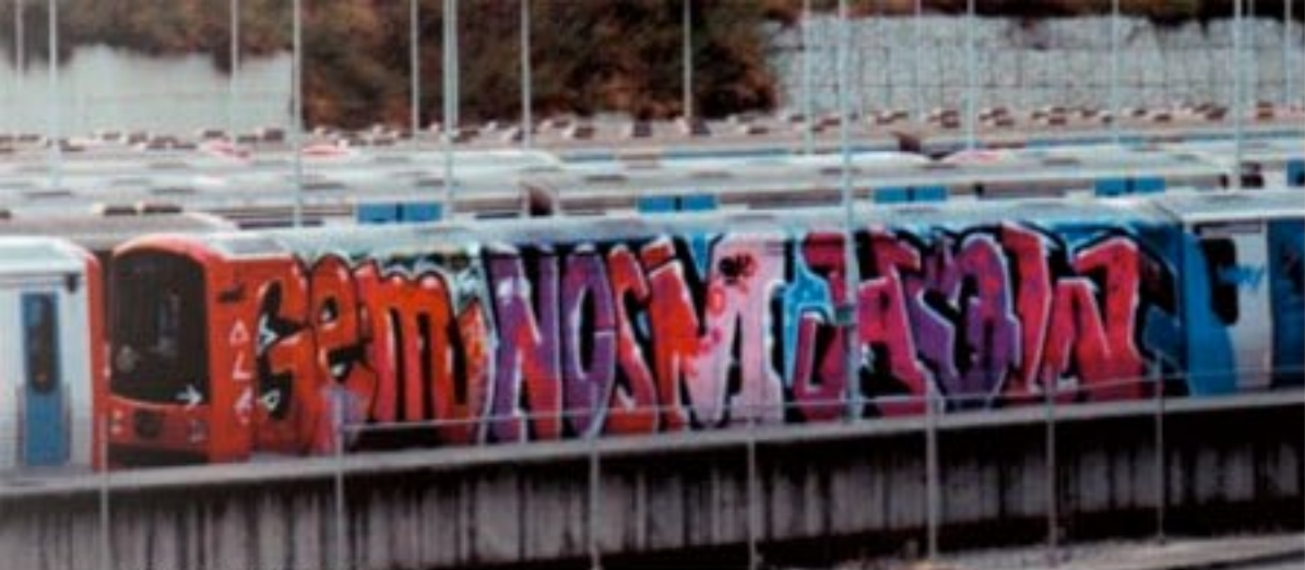
OS GEMEOS, NOSM, HOW / Lisbon, Portugal / 2007