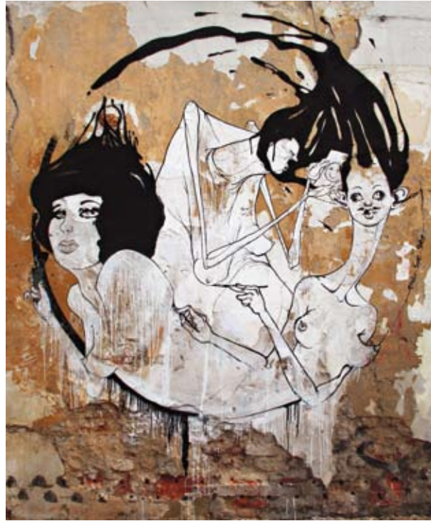
TOP: Sepe, Saiko, Esze, Warsaw / Poland 2010