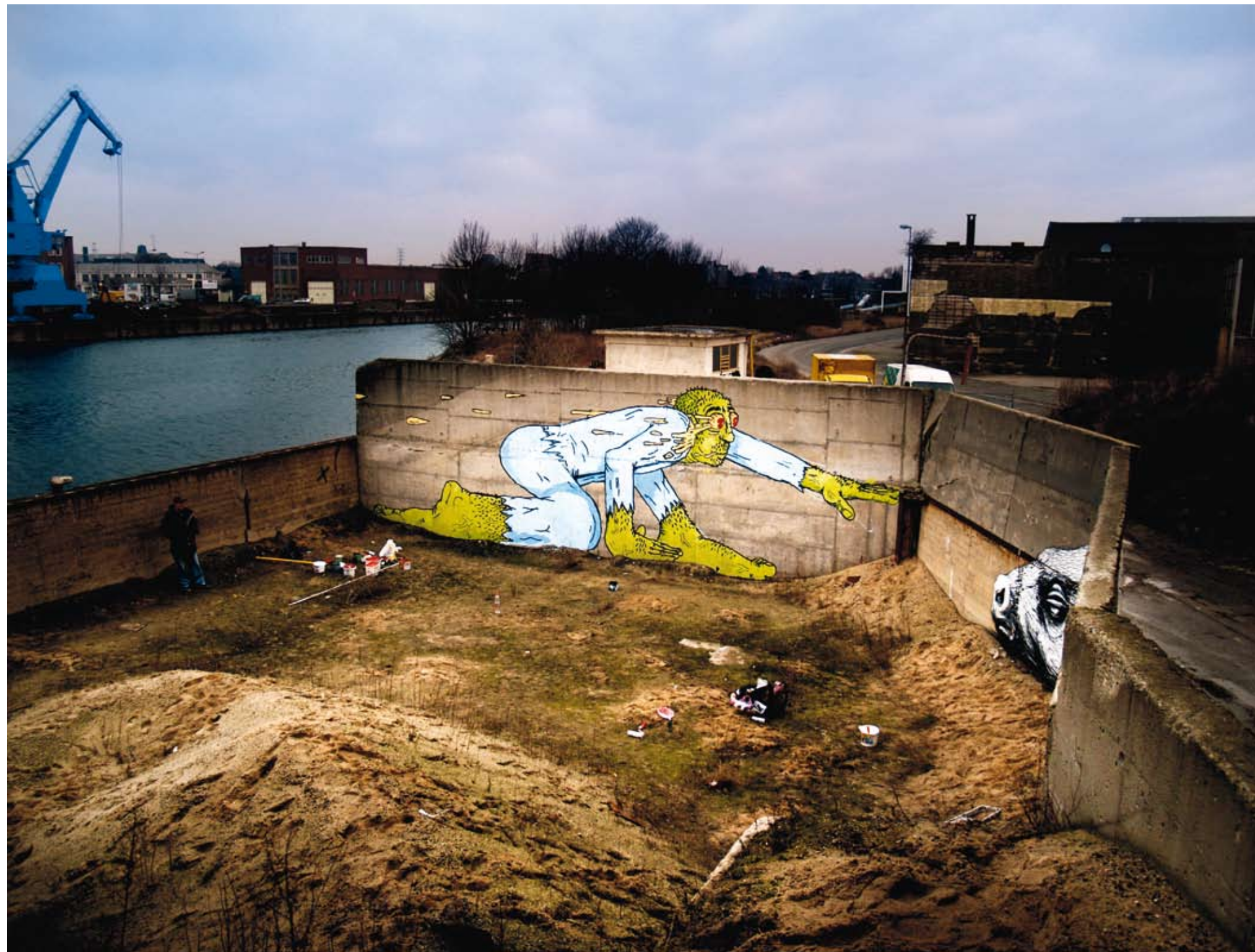
TOP LEFT: Resto, 'KEEP IT SPOR-T', Belgium, 2010