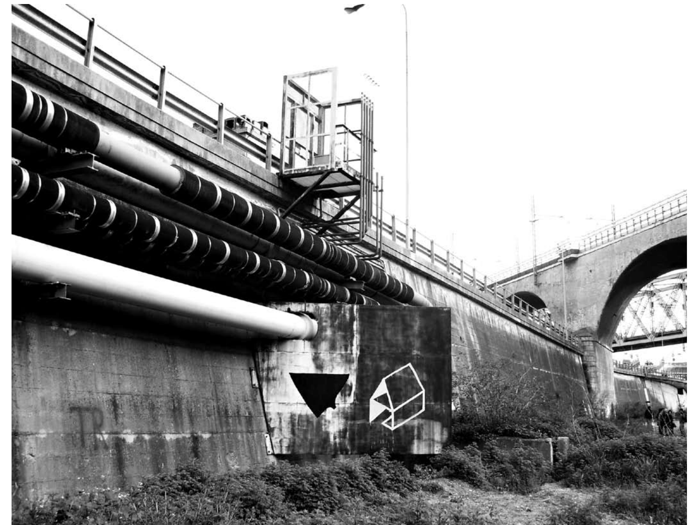
BOTTOM RIGHT: 108, 'BLACK SHAPE', Fame Festival, Grottaglie / Italy, 2010