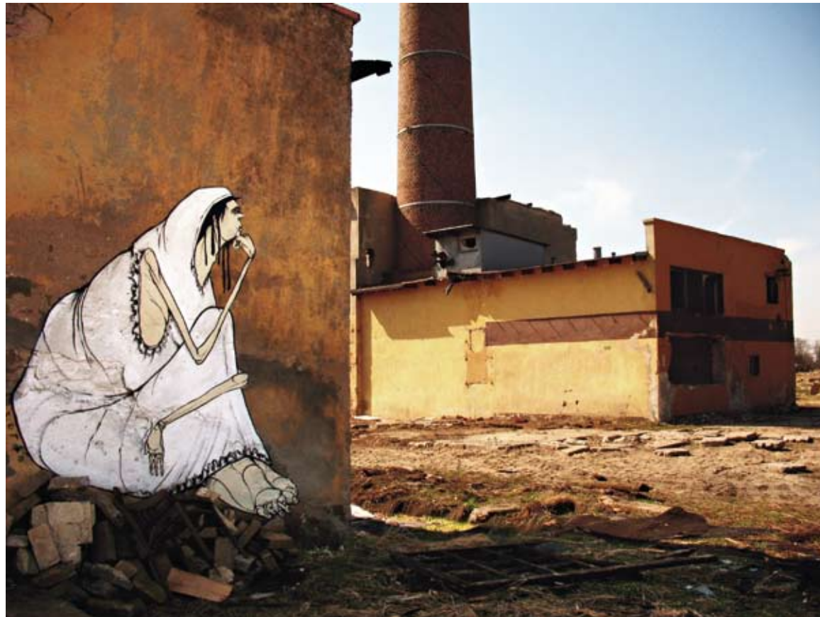
RIGHT: Sepe, 'HE(LL)AVEN', Kluczbork / Poland, 2010