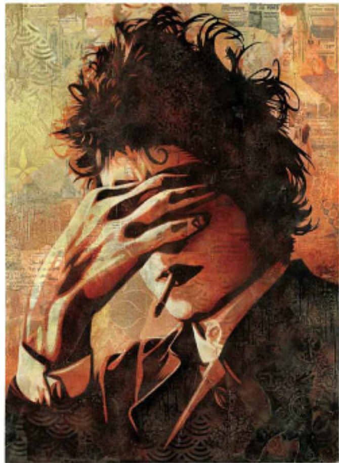
Screen print Odey Fikety , 2007 112 x 121 screen print and collage on album cover Drum Beats , 2007 112 x 121 screen print and collage on album cover Pinly Menart , 2007 112 x 121 screen print and collage on album cover Guitar Pin , 2007 112 x 121 screen print and collage on album cover